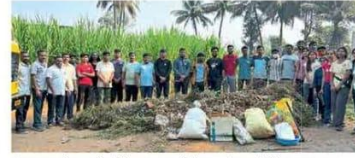
कंदलगाव : केआयटी कॉलेजच्या बाचणीतील श्रमसंस्कार शिबिरात श्रमदान करताना स्वयंसेवक व सहभागी ग्रामस्थ.